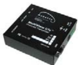
MultiView UTx Transmitter 400R3212