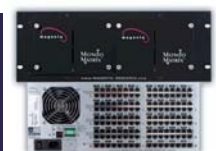
Mondo Matrix Cat5 Switch 16x16—256x256 221R3001