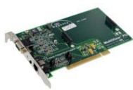
MultiView PCI Transmitter 400R3246