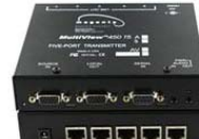
MultiView T5A Transmitter 400R3006