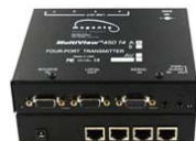
MultiView T4A Transmitter 400R2960