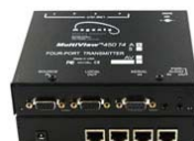
MultiView T4A Transmitter 4002959