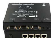
MultiView T4A Transmitter 4002959