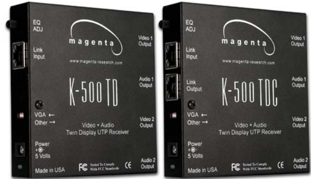
K-500 TD 4003377

“Twin Display” receivers provide dual audio and video outputs—perfect for applications with paired displays