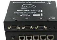
MultiView T5A Transmitter 4002941