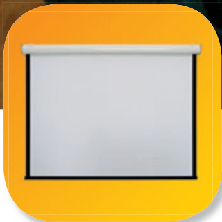
Ellipse Professional with three black borders (optional)

ELLIPSE fits properly in a/v professional applications like meeting and conference rooms or classrooms.