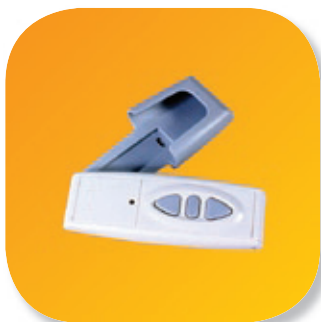
Remote control with integrated receiver (optional)