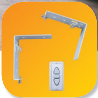
Wall or ceiling brackets and switcher (included)

ELLIPSE HOME CINEMA is an electrical projection screen suitable for "Home Theatre" applications. The absolutely refined and innovative design of the cabinet makes the screen versatile to different domestic interiors. Moreover, the finishing touches and the high quality standard of the ELLIPSE HOME CINEMA , assures the opportunity of producing at home a cinema atmosphere. It is available in 4:3 or 16:9 format and it has two side black borders, a black aluminium counterweight and a black top 30 cm. high. The PVC cloths we mount on these screens are certified flame-retardant classification M1 7201-96.