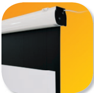
Ellipse Home Cinema: detail