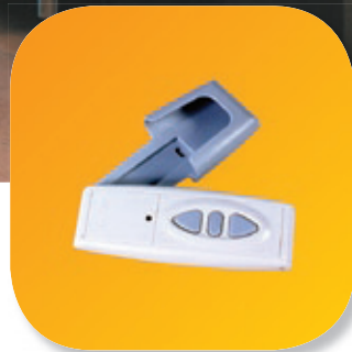
Remote control with integrated receiver (optional)