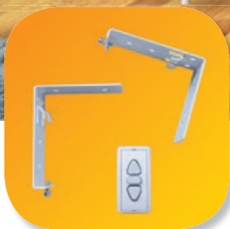
Wall or ceiling brackets and switcher (included)

Because of the finer details compared with the Home Cinema version, it is the perfect screen for customers who want the best performance from their Home Theatre system. The ELLIPSE TENSIONED is characterized by curved sides and a tensioning elastic yarn that assure the perfect flatness of the surface of projection. It has two side black borders, a black counterweight and a black drop 30 cm. high. On these screens we mount frontal projection cloths only. They have the flame retardant certification (class M1).