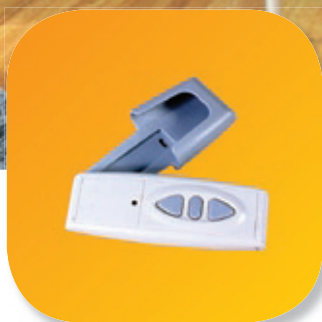
Remote control with integrated receiver (optional)