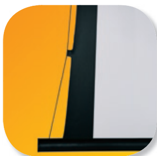
Ellipse Tensioned: detail of the counterweight