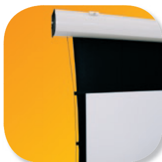
Ellipse Tensioned: detail of the housing