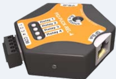
PX2-PUC-REL-4 Four low-voltage relays

Expand the Networked Room Controller's already extensive capabilities to control virtually any audiovisual device in your room. Simply daisy-chain additional Control Pucks (up to 32), using CAT5 cabling as the method for interconnection. Controlling more devices has never been easier. Control Pucks are available in three configurations