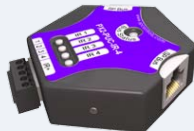
PX2-PUC-IR-4 Four IR out (includes four IR emitters)