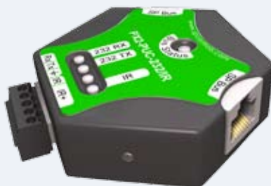
PX2-PUC-232-IR One RS-232 port + one IR out