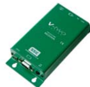
V2R-0101SBN receiver with skew correction